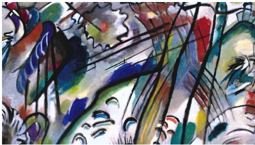
Wassily Kandinsky. Improvisation 28 .

Please turn in on Google Classroom in the designated place for this assignment please do so as a Google Doc - this allows me to make comments and grade on your document, trust me I will be teaching you how to write proper essays during this course. The paper should be 1-2 pages, double spaced in Times New Roman 12 pt. font