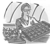
Nursery, Sod, Greenhouse