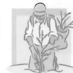
Trees, Timber, Plants, Flowers